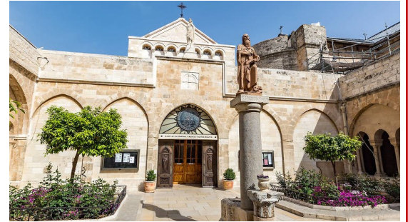
Church of the Nativity, Bethlehem

To subscribe to St. Elizabeth’s weekly journal, visit www.seocc.org