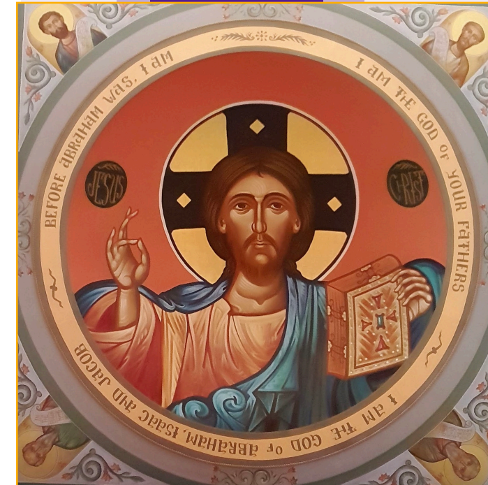
Jesus Christ - The Pantocrator